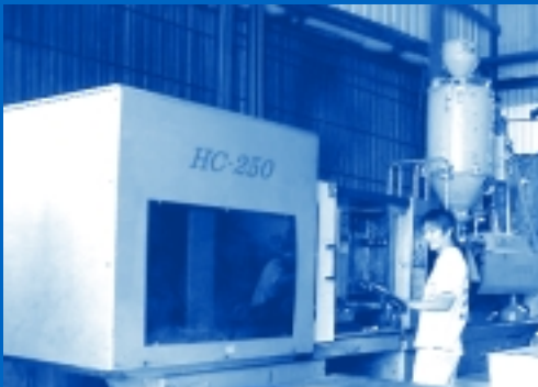
Precision injection molding