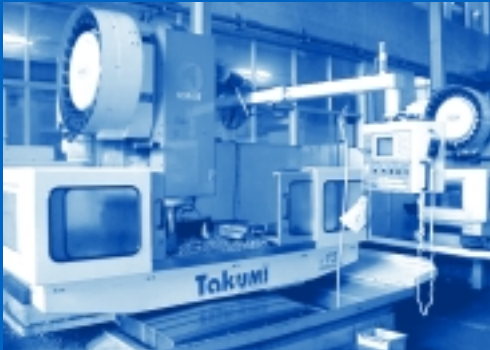
Custom machining and metalwork