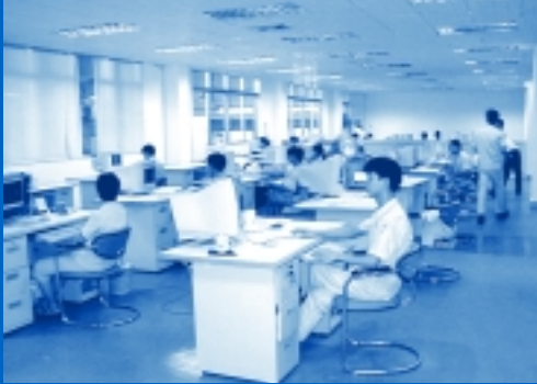
Computer aided design and engineering